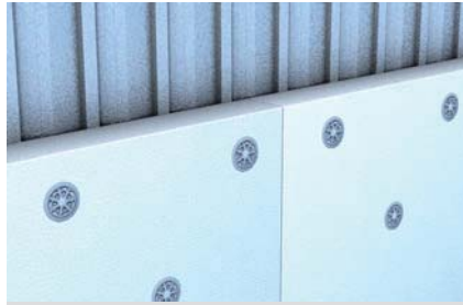
Polystyrene rigid foam boards on metal sheet