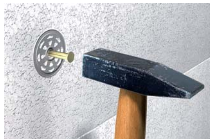
Setting the hammer set fixing on polystyrene rigid foam boards