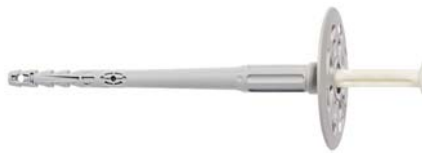
termoz PN 8