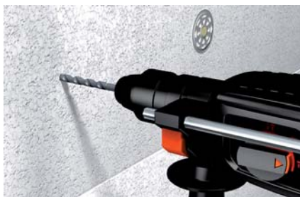
Polystyrene rigid foam boards